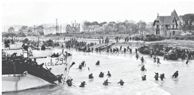
Canadian troops landing at Bernières-sur-Mer on June 6, 1944.