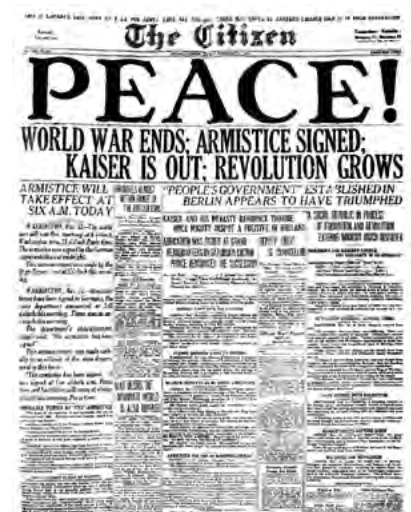
Front page of the Ottawa Citizen on November 11, 1918.

The United States used to commemorate Armistice Day. However, in 1954 they changed the name to Veterans Day.