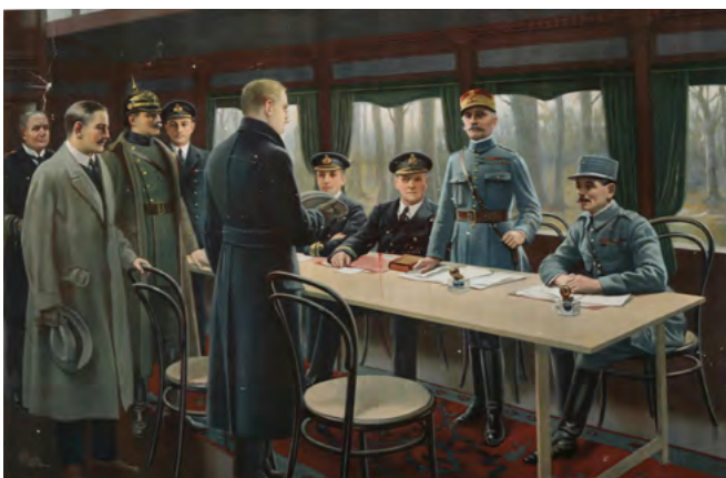
Armistice, November 1918. Senior German and Allied commanders and politicians sign the Armistice ending the war in a railway car near Compiègne, France, early on the morning of 11 November 1918. Field Marshal Ferdinand Foch, the Allied supreme commander (centre), stands to accept the German surrender. In 1940, during the Second World War, Adolf Hitler demanded France’s surrender in the same railway car.